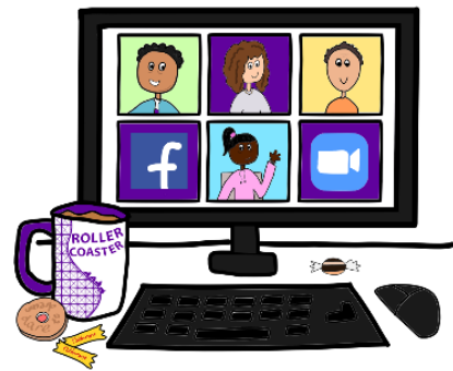
Digital and 1:1 support